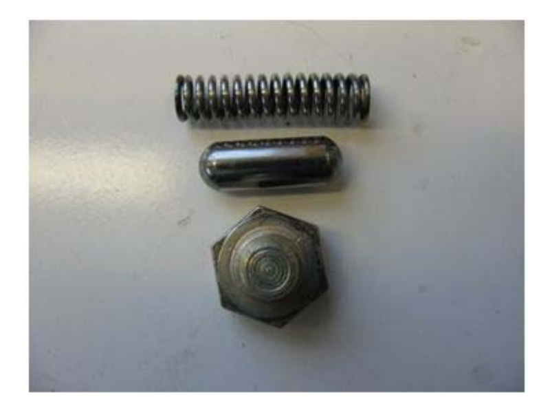
...insert the detent, with a little dab of grease...